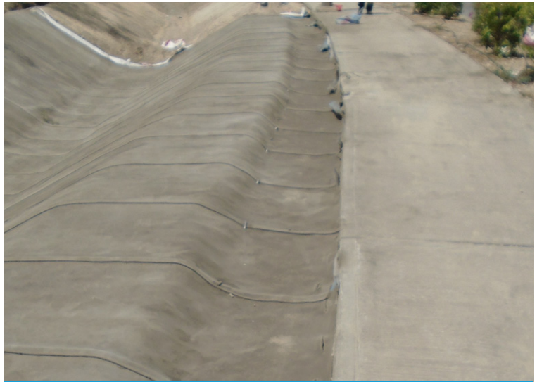
CCH pegged within anchor trenches