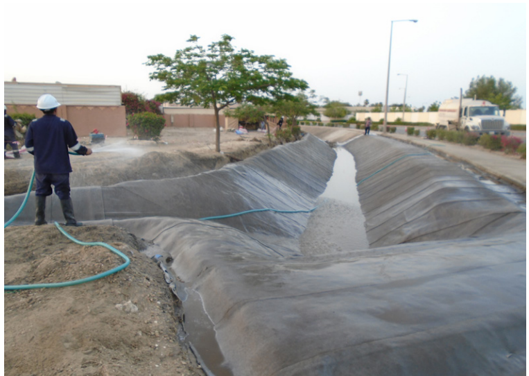
Hydration of CCH was carried out in the evenings