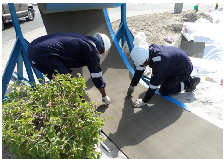
CC deployed from spreader beam and steel stand