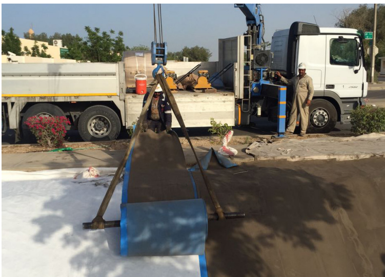
Deploying CC from spreader beam and boom truck