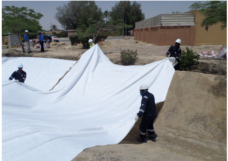
Installation of geotextile