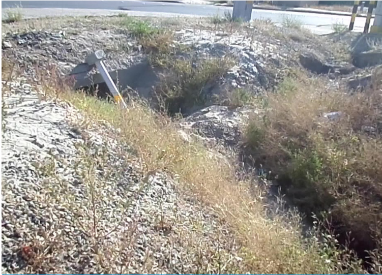
Channel prior to works