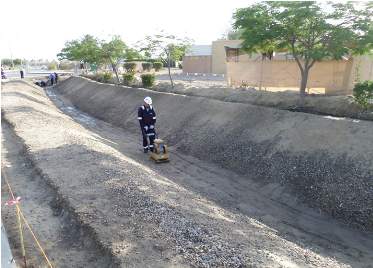
Compacting the substrate