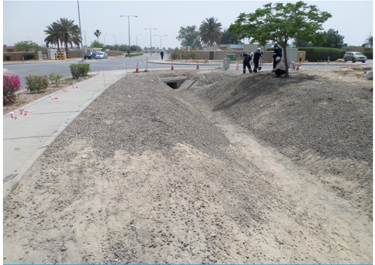
Following profiling and grading of the channel