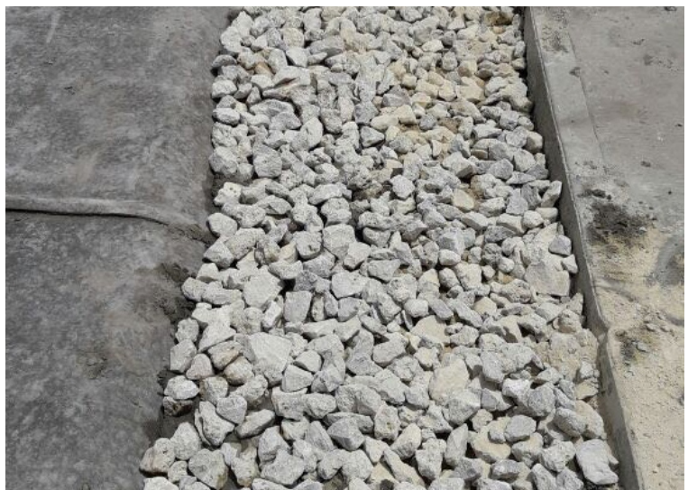
Gravel placed over poured concrete anchor trench for neater termination