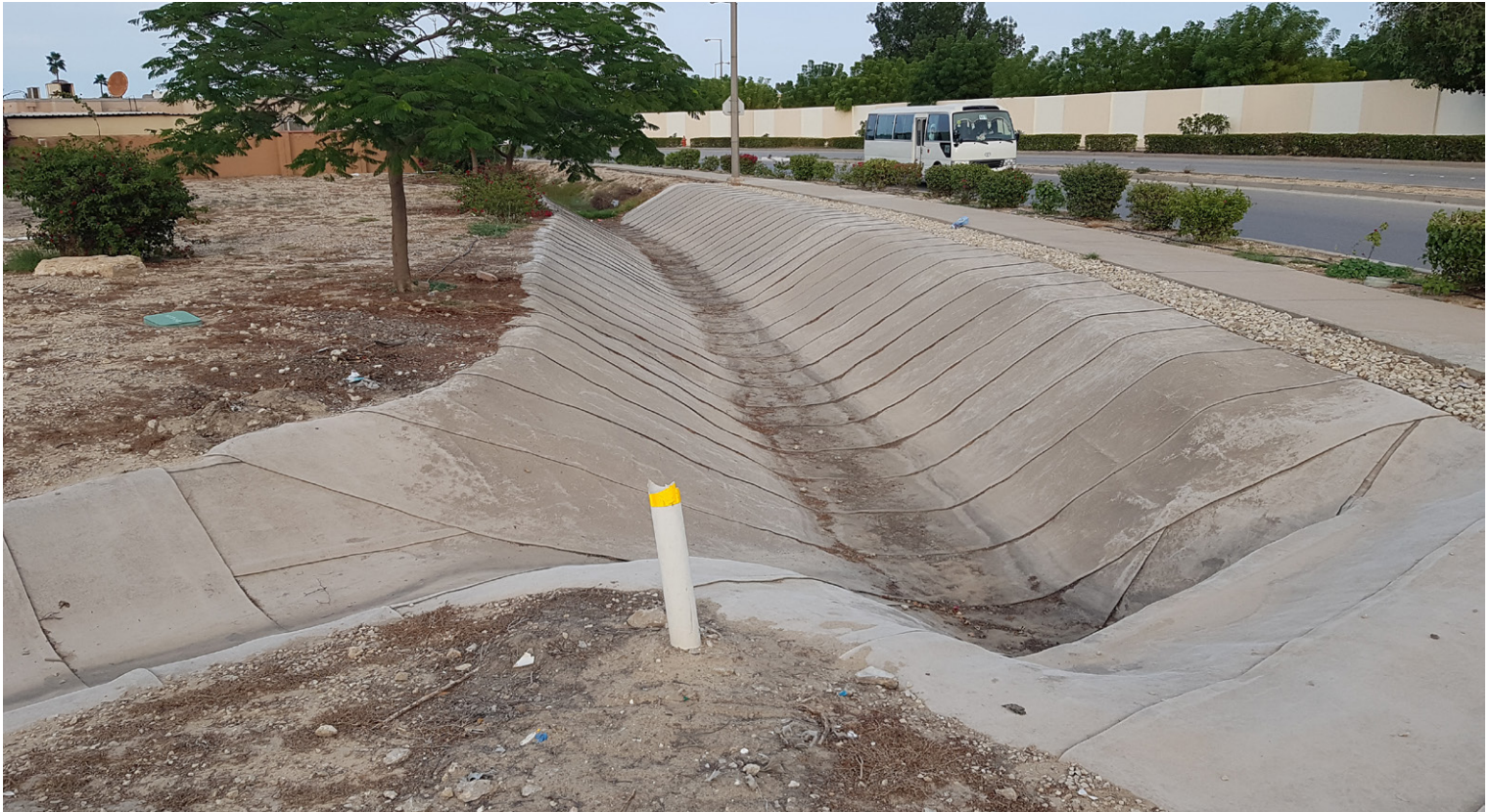
On a return visit to site in January 2020, the channel was found to be performing well

In preparation for the installation, loose soil and vegetation were removed by the client prior to handing over to the contractor, FOQSCO. The channel had crumbled over time due to erosion of the soil and gravel-based substrate. To prepare it for installation, the channel was profiled, graded and then compacted using plate compactors. Anchor trenches were then prepared on both shoulders and a layer of geotextile was laid across the channel profile to provide an additional layer of protection to the CCH geomembrane backing, preventing puncture from the gravel below.