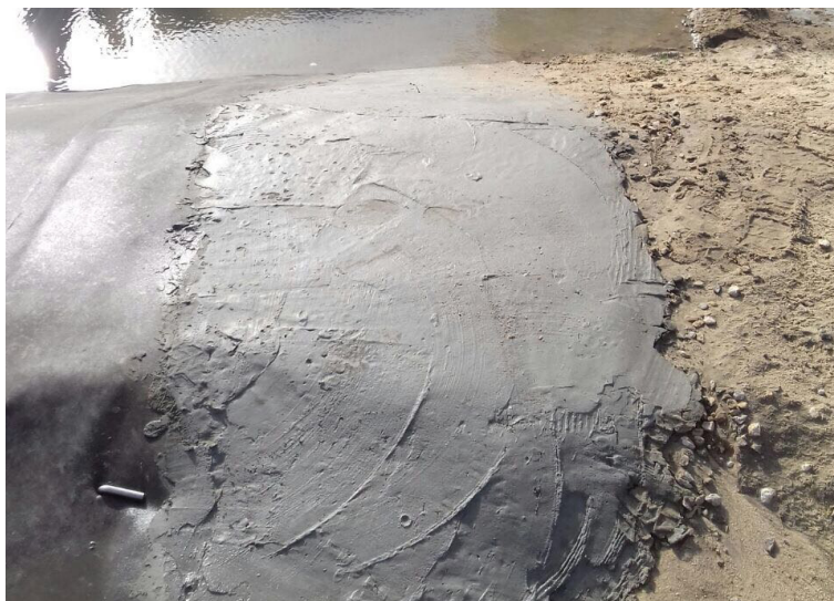
Anchor trenches filled with poured concrete