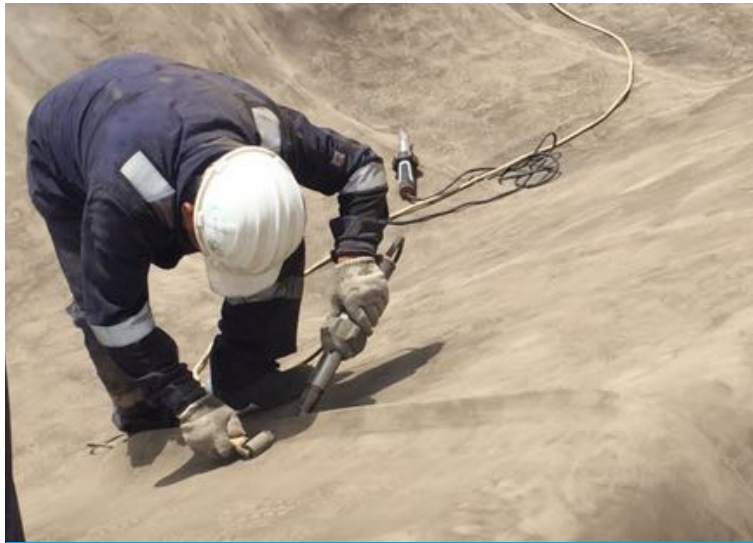
Thermal welding of CCH overlaps