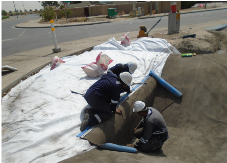
Fixing CCH to existing concrete infrastructure