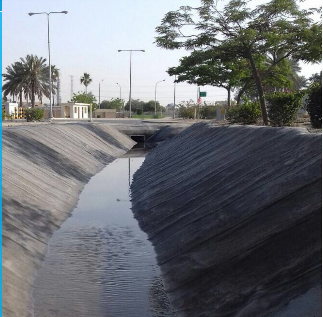
Completed channel following installation

In May 2017, CC Hydro™ (CCH) was installed as an impermeable channel lining solution at Lulu 92, Royal Commission Jubail in Saudi Arabia.