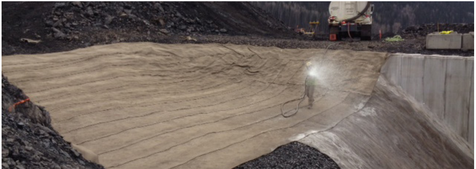
Hydration of top section of carrier channel