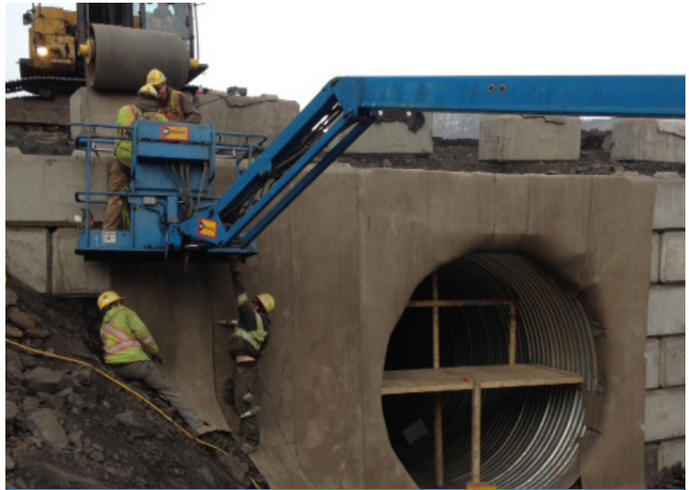
Lining culvert with CC8™