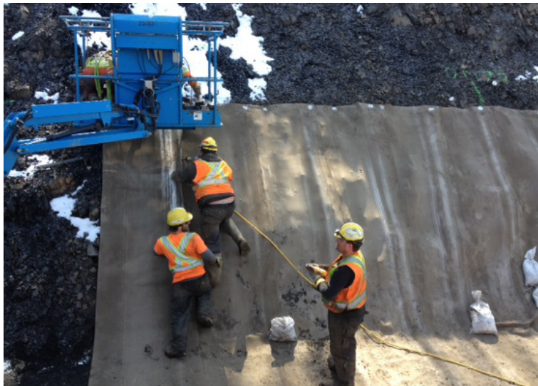
Applying Sikaflex beading to joints