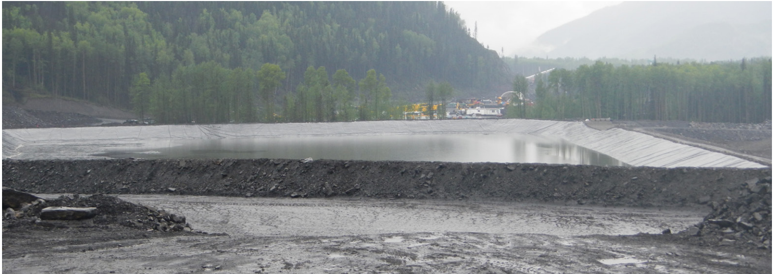
Large settling pond collecting effluent from nearby Willow Creek mine

The channel terminated in a 4m diameter corrugated steel and concrete block work culvert and sump which was also lined with CC to ensure minimum water loss. This was imperative as the water was contaminated from tailings and could not come into contact with any other water sources.