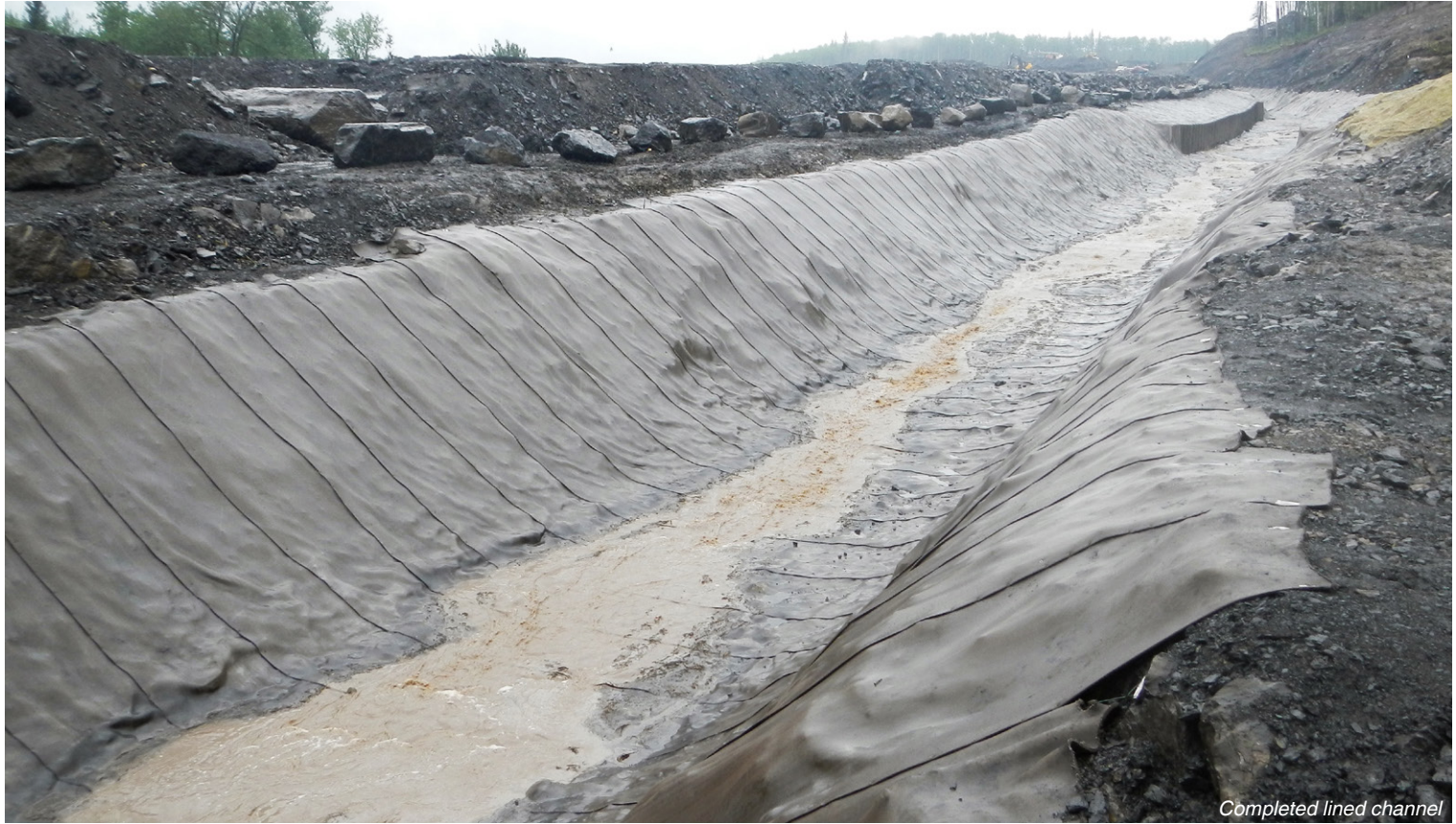
Completed lined channel

A total of 10,150m 2 of CC material was installed by Leducor Group on schedule in under six weeks, on a remote site and in difficult weather conditions. Leducor were impressed with their first experience of installing CC, noting several advantages of using CC compared to traditional concreting methods: speed and ease of installation, minimal amount of training or specialist equipment required, ability to install CC in all weather conditions, minimal waste material compared to shotcreting. CC also provided substantial cost savings for the project.