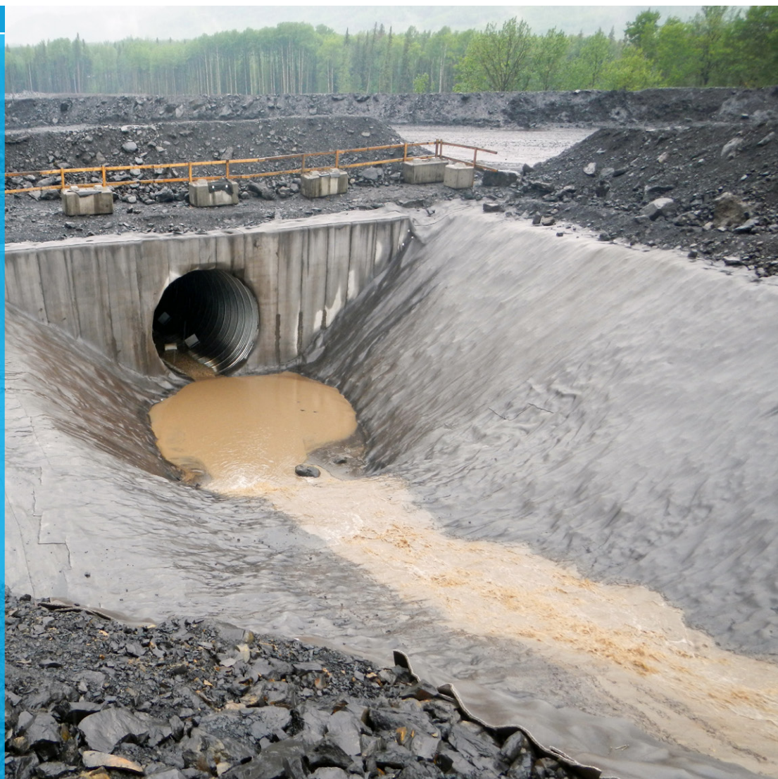
Completed lined channel and culvert

In February 2012, Concrete Canvas® GCCM* (CC) was used to line a carrier drain channel on the Willow Creek mine site in British Columbia, Canada.