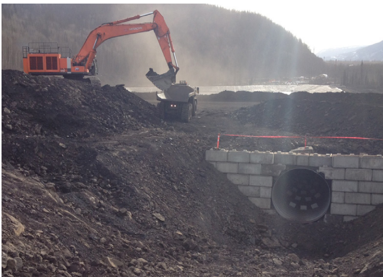
Excavating sump and constructing culvert