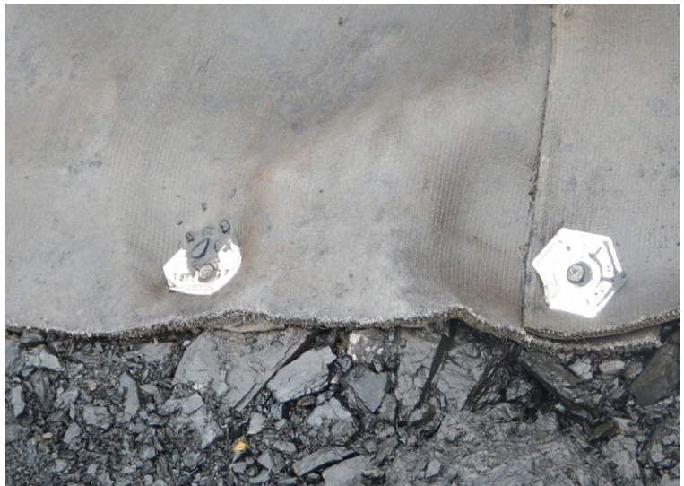
6" steel anchor nails with 1" hex head washers

Grout was chosen in areas that may be prone to heavier flows and related scouring, and used to seal edges of the material to ensure ingress would be avoided. In an effort to minimise the possibility of potential debris dams, grouting also eliminated the lip that was caused from the overlaps of CC layers.