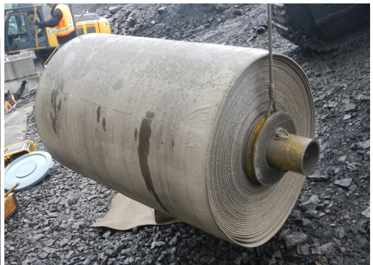
CC bulk rolls dispensed using spreader beam and plant