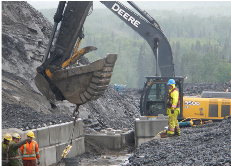
CC deployed across channel width