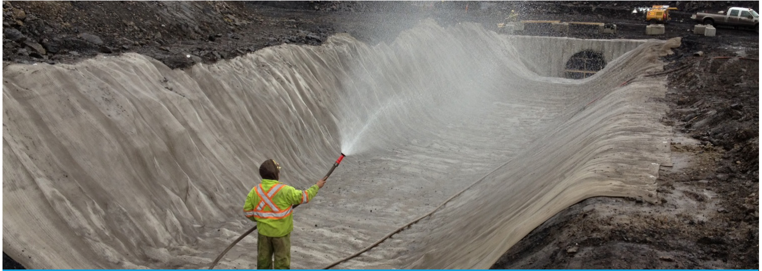
Hydration of lower channel section