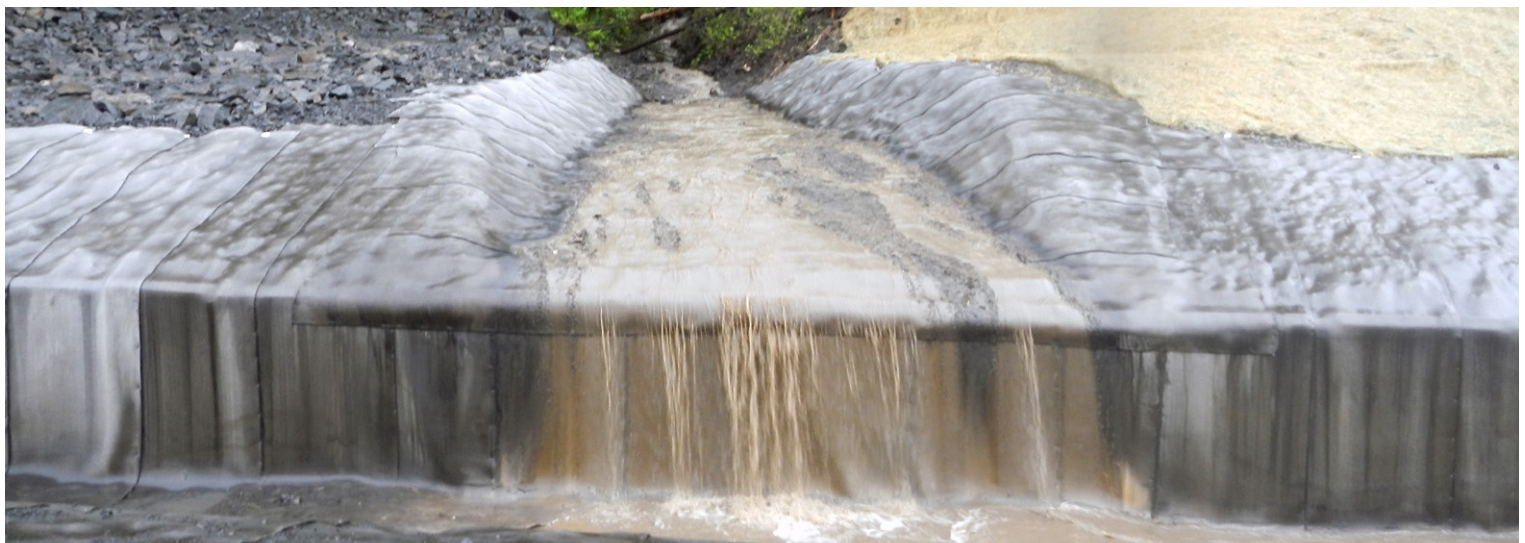
Swale was formed on the north ridge of the channel at a nearby tree line to collect surface rainfall from an adjacent hillside