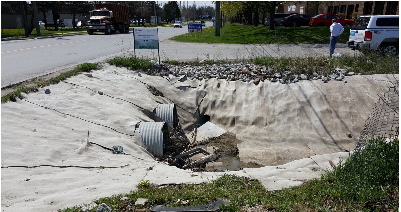
36 months after installation CC is holding strong with no vegetation growth