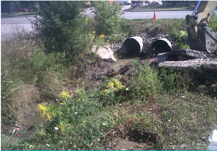
Area before site preparation and CC installation