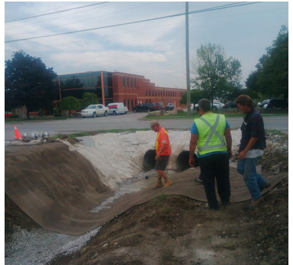
CC installation - August 2013